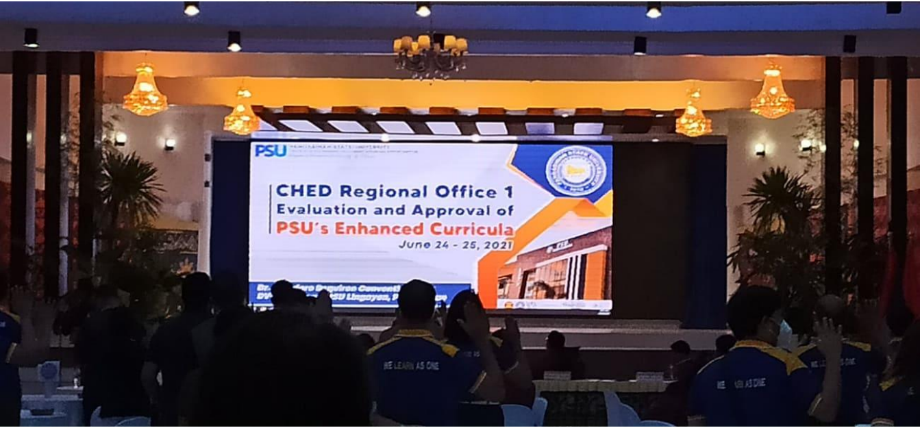
Photo-documentation of the Enhanced Curriculum Presentation