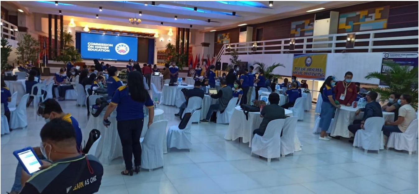
Ceremonial Turn-over of the Enhanced BSIT Curriculum to the CHED Regional Office 1